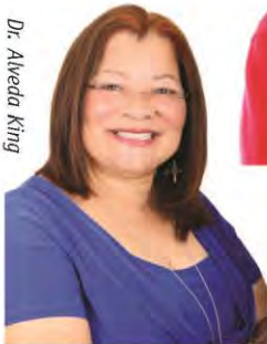
Dr. Alveda King

For more information or to register call 800-338-2445 or visit www.nsc-chariscenter.org